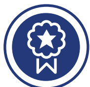
Image and Awareness Studies, Feasibility Studies , Mystery Shopping, In-Depth Interviews , Intercept Surveys, and Customer Satisfaction Surveys

Conducting Focus Groups in Central New York has proven to be ideal, with our regional demographics matching the entire country on key attributes such as age, education, employment, gender, and income.