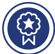
Image and Awareness Studies, Feasibility Studies , Mystery Shopping, In-Depth Interviews , Intercept Surveys, and Customer Satisfaction Surveys

Conducting Focus Groups in Central New York has proven to be ideal, with our regional demographics matching the entire country on key attributes such as age, education, employment, gender, and income.